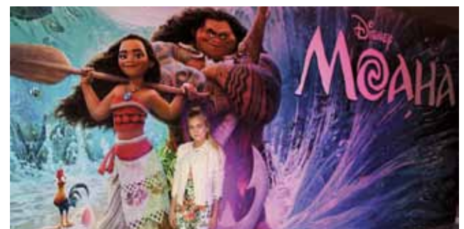
Playbill featuring a character from the animated film

the character of Moana immediately and that it took no time at all to 'find' her personality. "I took to it like a fish to water," she tells us. "I read the text and sang in the cartoon.