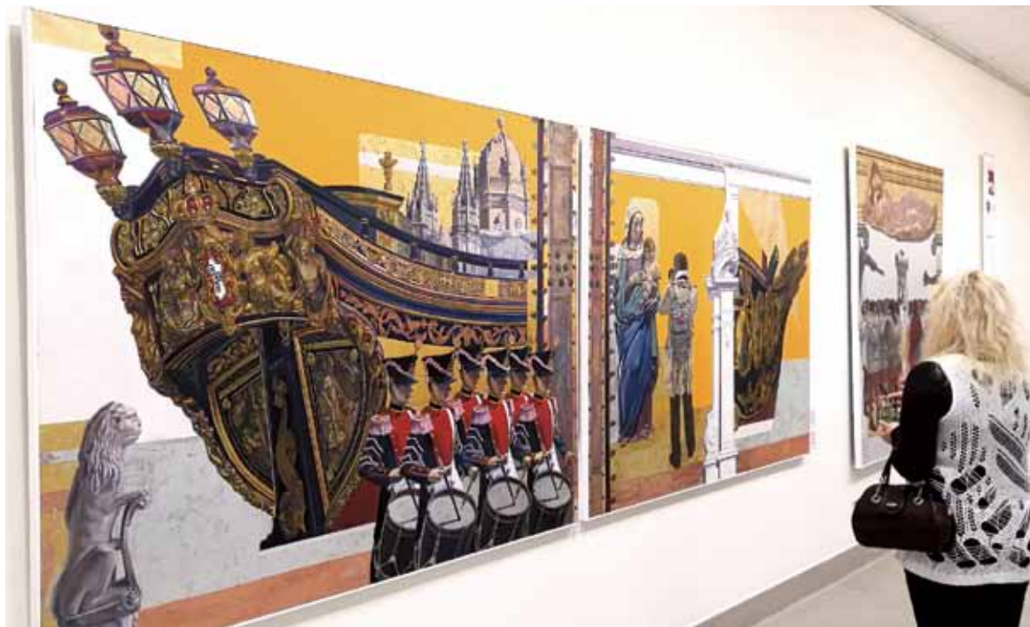
Belarusian artist Victor Alshevsky's works on show

Vladimir Makei, Belarus' Foreign Minister, and Chairman of the National Commission for UNESCO, noted at the exhibition