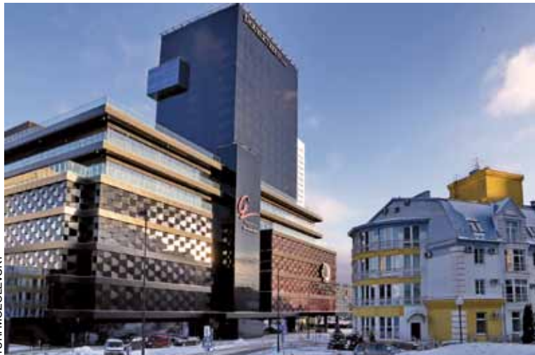
Double Tree by Hilton Hotel

Since autumn of 2015, the corporation has opened two sites in Minsk: the mid-priced Hampton Hotel and the Premium Double Tree. Of course,