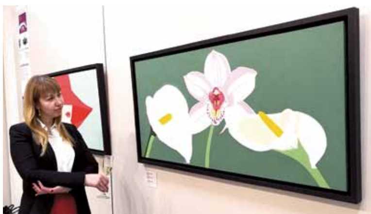
Brightly coloured exhibition

opening, "Belarus, situated at the intersection of roads connecting Europe and Asia, has always tried to promote peace and good neighbourliness to the region. We advocate for the development of good neighbourly relations with other countries worldwide, regardless of their geographical location or length of borders. We have a respectful at-