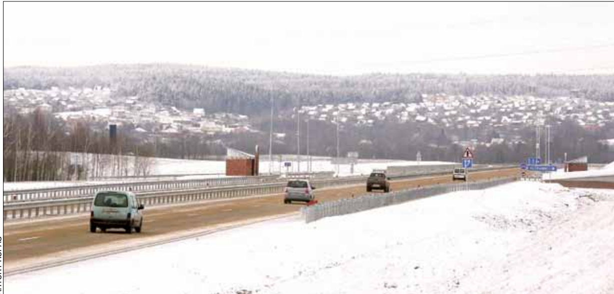
The newly commissioned section of Minsk second ring road

"The launch of the second section will help ease the burden on the first ring road, while uniting key transit routes for the vital trans-European corridors, from the north to the south and from the west to the east. This will improve the ecological situation in Minsk and should stimulate