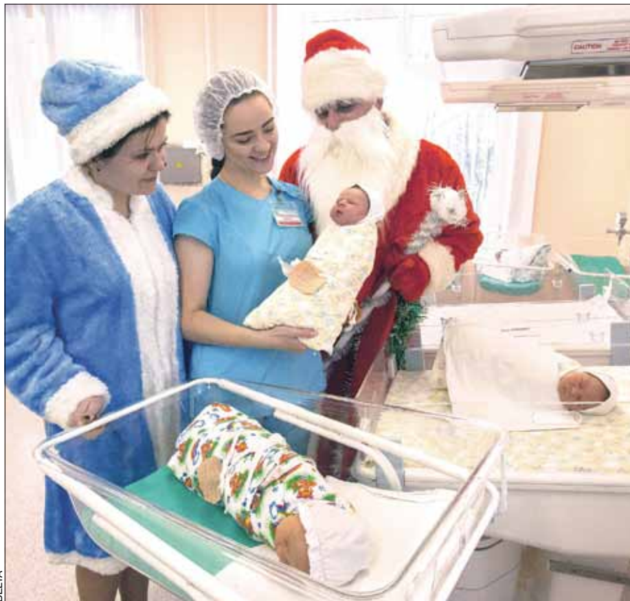
Father Frost and Snow Maiden at Vitebsk Regional Maternity Hospital

During a recent sitting of the National Commission on Children's Rights, the issue was high on the agenda, as the Deputy Prime Minister, Natalia Kochanova, notes. She said, "In Belarus, 892 children are included on the register of those in need of palliative care. Most live with families and receive home care, as parents want to care for their children independently. We have a clear system of training (for professionals and family members), to support