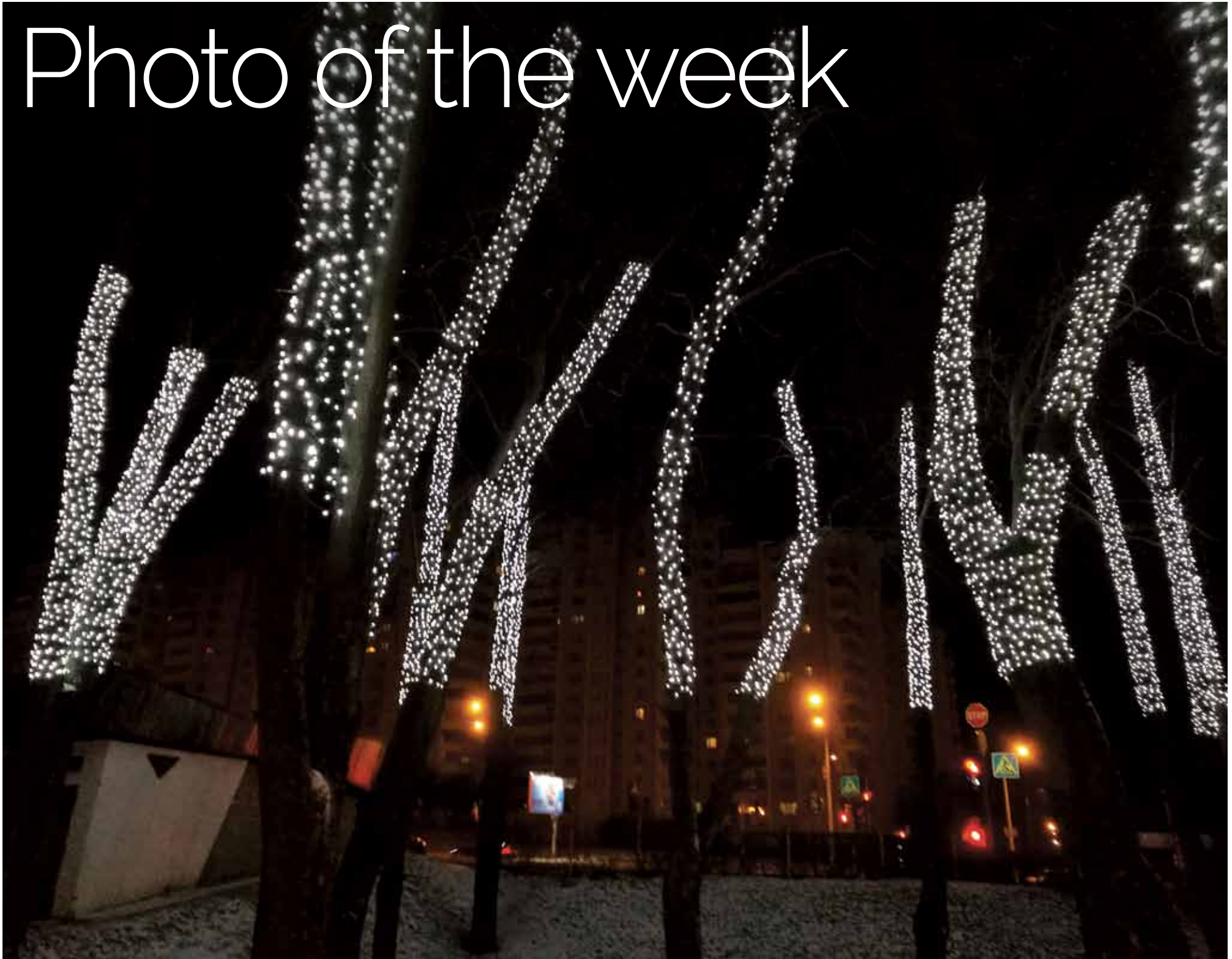
New Year tree silhouettes, on Minsk's Pobedy Square