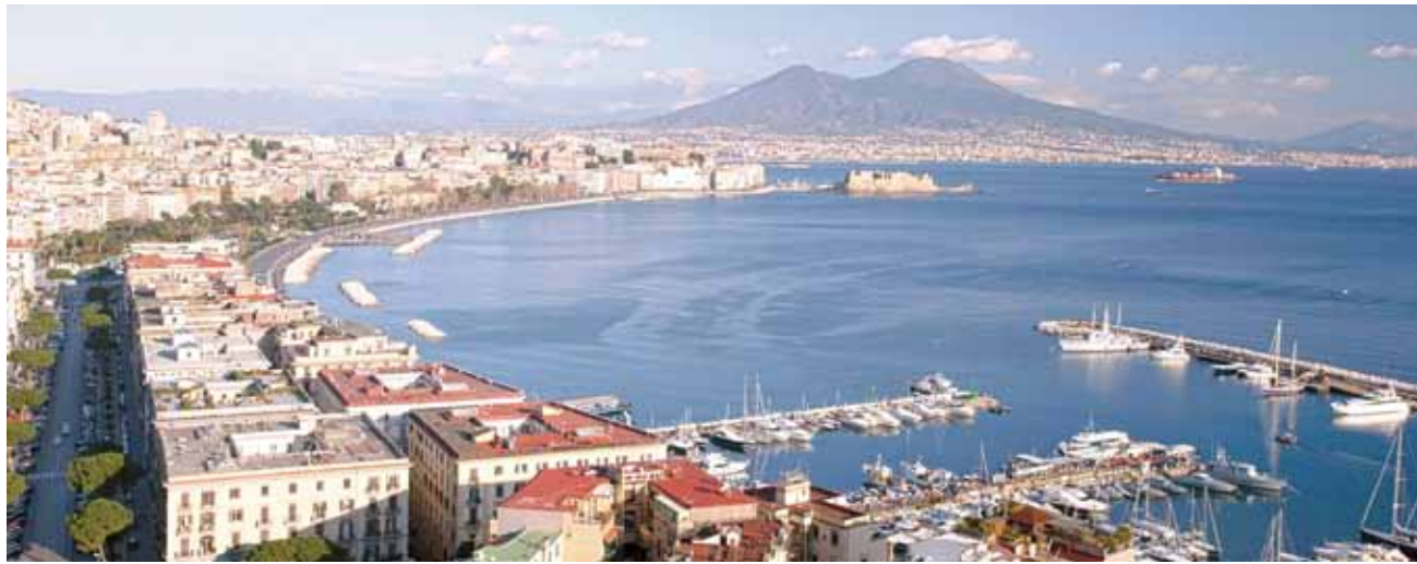
From the town quay, a view opens to Vesuvius volcano

Several artistes on the trip shared their surprise, saying, "Citizens in this city move strangely. Why are they all rushing about?" At that mo-