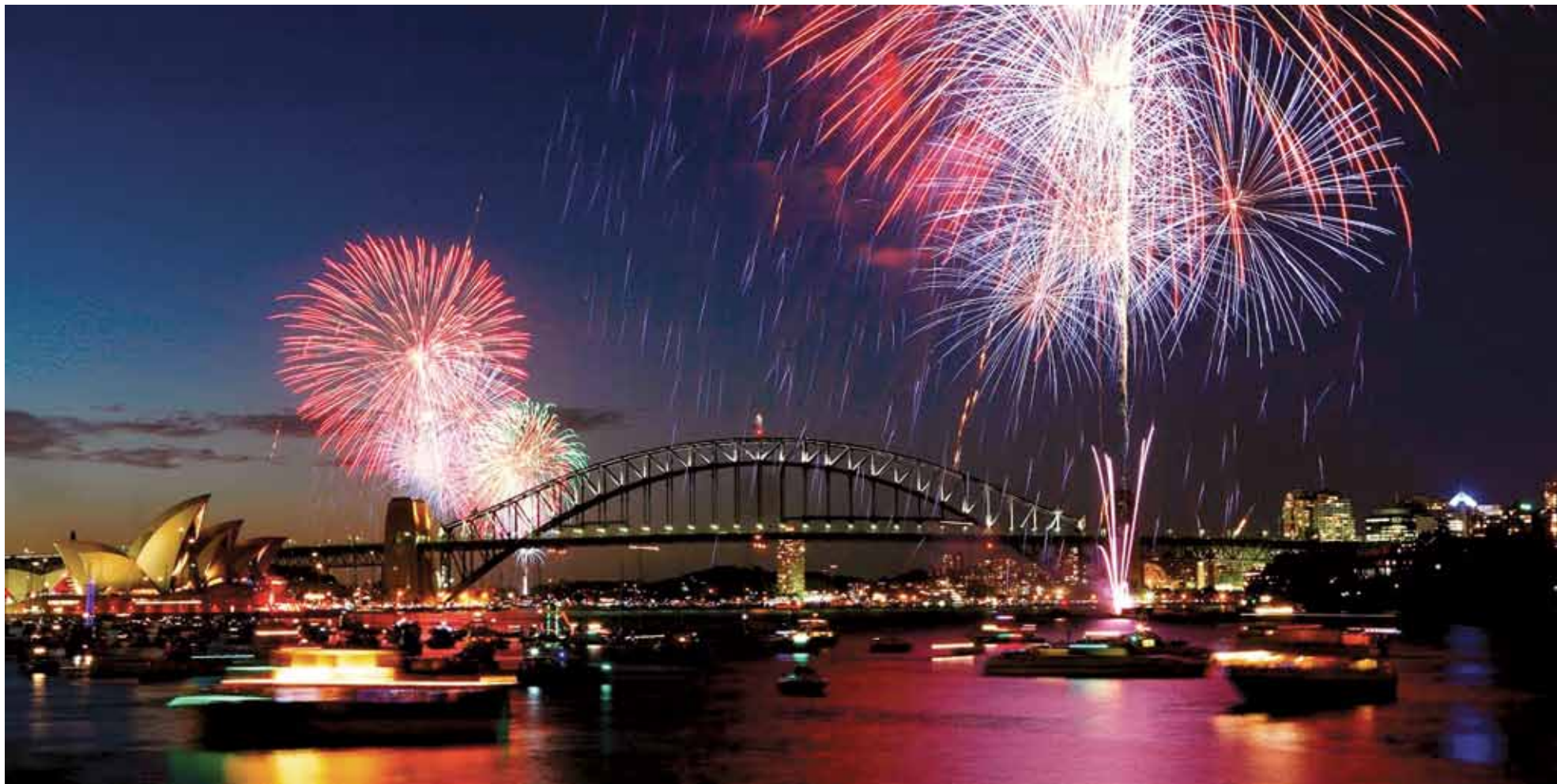
Sydney welcomes in 2017 with its biggest-ever fireworks display, accompanied by music, thrilling packed crowds