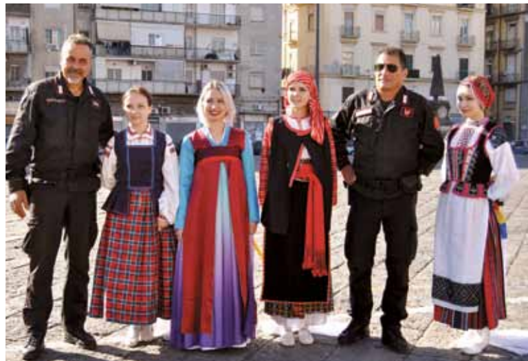
Carabinieri and artistes of Korean Arirang ensemble, from Belarus