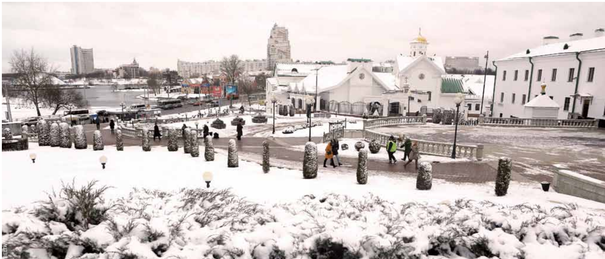
View of Troitsky Suburbs and River Svisloch from the Upper Town, in Minsk