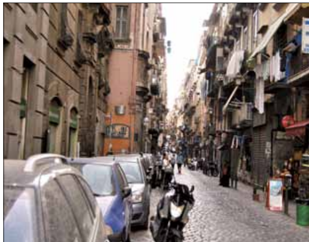
In a Naples street