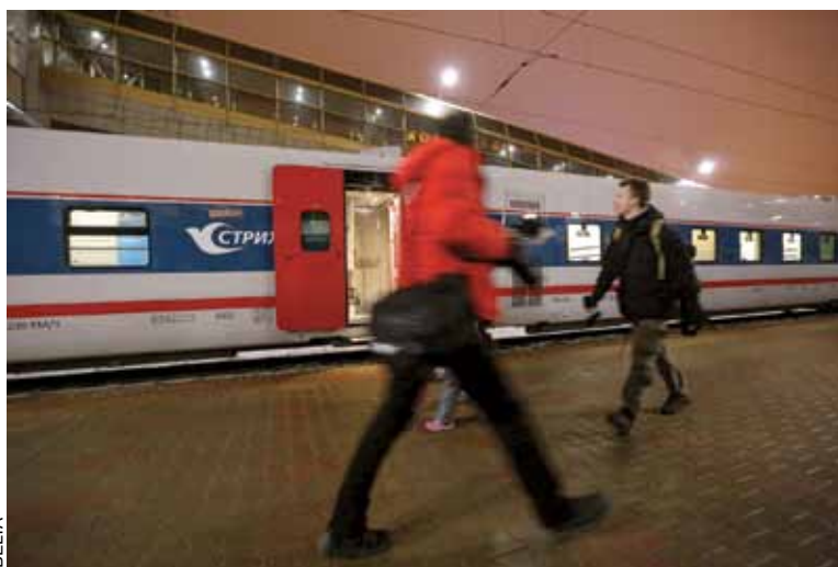
'Strizh' high-speed train at Minsk-Passazhirsky station

The travel time for the train's route has been significantly reduced thanks to quicker switching from a 1,520mm track gauge to a narrower gauge at the Belarusian-Polish border. From now on, at Brest station, the switching of the train, comprising Talgo carriages, will be auto-